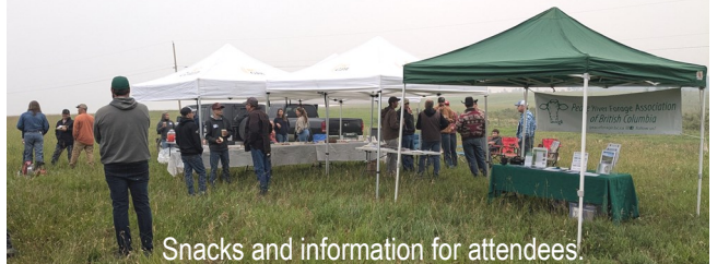
Snacks and information for attendees.

The Peace River Forage Association (PRFA) of BC received funding for the “Training & Acquisition of Wildfire Response Equipment,” which we call the “Fire Schools & Fire Wagons” project. Total project funding is $644,728 with $432,000 allocated to the two Fire Wagons (Wildfire Structural Protection Unit Trailers) and the remaining to providing Fire Schools (Wildland Fire Training).