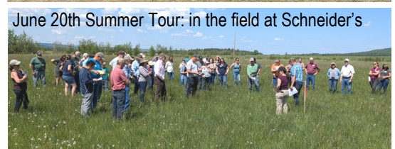
June 20th Summer Tour: in the field at Schneider's