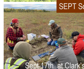
Sept 17th at Clark's