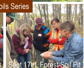
Sept 17th Forest Soil Pit