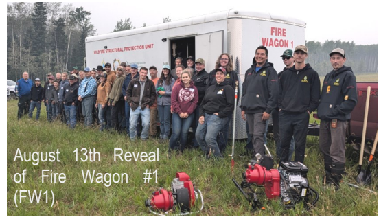
August 13th Reveal of Fire Wagon #1 (FW1)

The year has been full and rich, with many experiences and successes. Of course, there were lessons learned and room for growth & improvement, but how boring would it be if we had already achieved perfection! I am grateful for the opportunity to be so directly involved with the support of the Peace Region forage and livestock industry and to serve the Peace River Forage Association in the role of coordinator where I get to work with an amazing team of contractors, innovative producer members, and a supportive board.