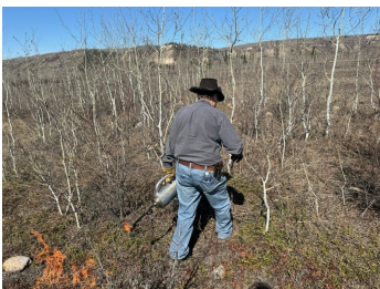
Ardill Ranch Prescribed (Rx) Fire, April 2024 (left, middle & right)