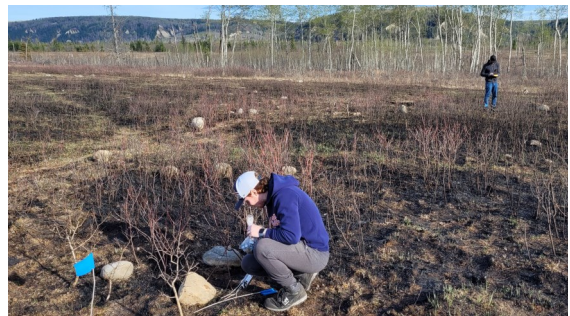
AAFC staff at sampling locations following a Rx fire.