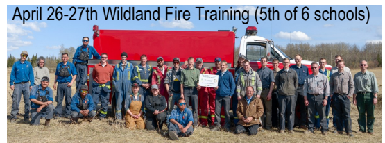
April 26-27th Wildland Fire Training (5th of 6 schools)