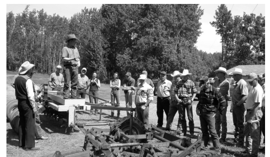
Nutrient management BMPs described at the Livestock & Forage Tour in June.

In total, there were 7 summer events, reaching over 330 people.