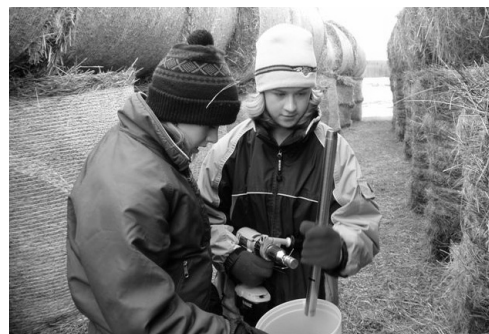
Sampling for winter feeding strategies.