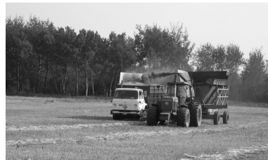
BMP demo of direct seeded silage crops.

Leased a Flexicoil zero till drill and direct seeded 900 acres in 2003 and 1600 acres in 2004. Established & monitored 7 demo plots of direct seeding forages.