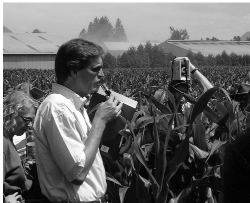
Sustainable Farming Field Tour in Eastern Fraser Valley in July.

The BC Taking Charge Team actively encourages agricultural groups to include speakers and topics about BMPs in their winter events. In 2004, there were 8 winter events reaching over 325 people.