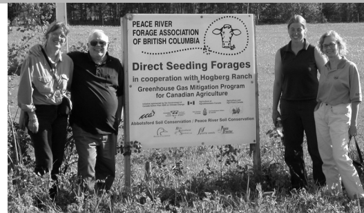
Members of BC Team during the Super Soil Savers Solstice in June, 2004.