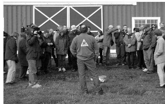
A crowd gathers for Delta Farmland Wildlife Trust Fall tour in October, 2004.

This 4 year program is entering its final year, with many successes along the way. Numerous BMP demonstration sites were established. Newsletters and fact sheets have been widely distributed and a myriad of awareness activities have been organized to help farmers and ranchers learn more about climate change BMPs. (see inside detail about demos and activities)