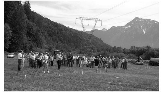
Over 65 people visit demo plots during the Sustainable Farming Field Tour.