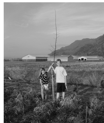
Tree planters at Sunshine Hog Farms.

The mandate of the Abbotsford Soil Conservation Association is to maintain and enhance the long term productivity and profitable agricultural land base of Abbotsford.