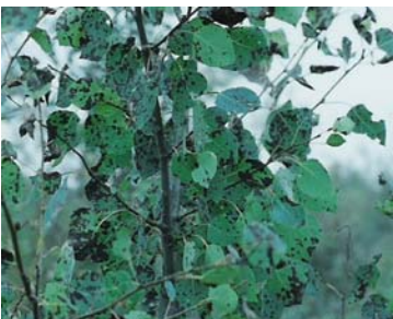
Poplar Regrowth 1 week after being sprayed with remedy, notice black dead spots on leaf.