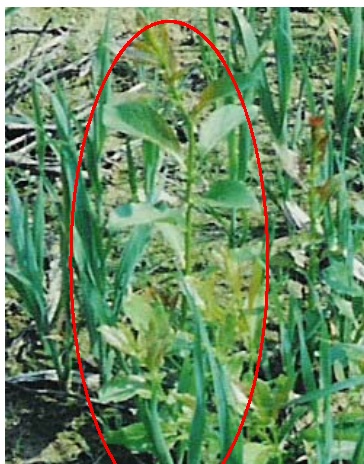
Notice poplar regrowth in field which was worked and seeded this spring.

The Bickford ranch has recently applied Grazon to some of their pastures stunting woody regrowth and delaying future aspen and willow regrowth. Their target is increase desirable grass species and a decrease undesirable species, they are also planning to integrate grazing management to minimize new woody plant growth.