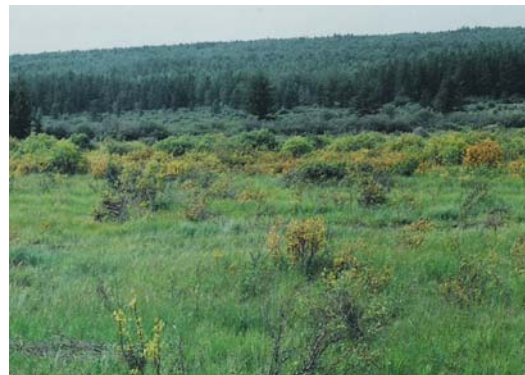
Pasture sprayed with Grazon 1 week ago. Yellow plants are showing initial symptoms of control. Cows were in pasture at time of spraying.