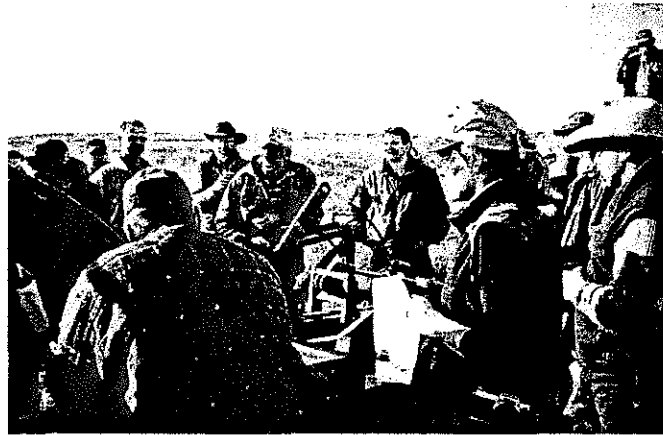
Over 30 people attended the Pasture Plough Demo and Friendly Forage Field Day hosted by Kendrews, Wilsons and PFRA-Agric Canada on October 15.