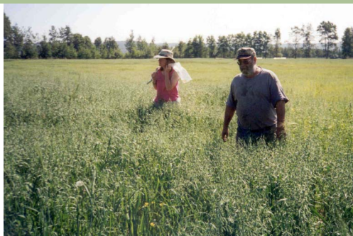
Nutrient trials at Sutherlands, Groundbirch

Progress to Date: photos, forage plant descriptions, calendar of cattle movements for 2 year at 3 sites.