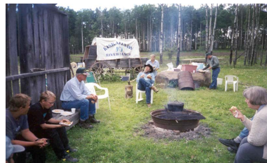
Friendly Forage Field Day with Nimitz family

Progress to date: 15 forage facts have been compiled & more are in progress.