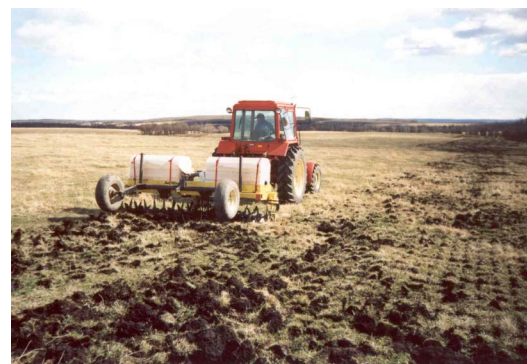
PRFA of BC's AerWay with water tanks